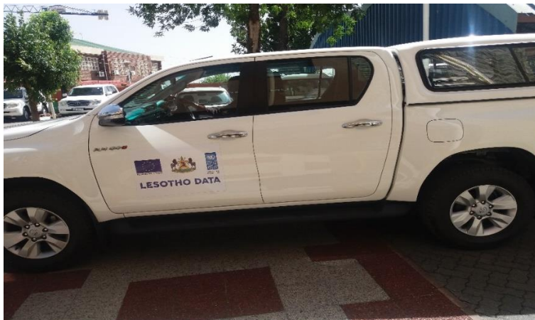
Pic 5 Banners and vehicle branding