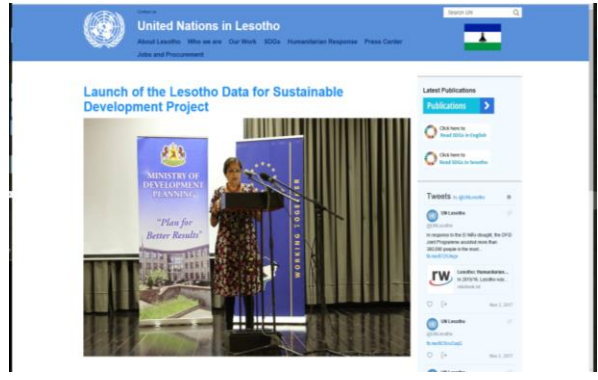
Pic 2. Excerpts on internet coverage of the Lesotho Data project.