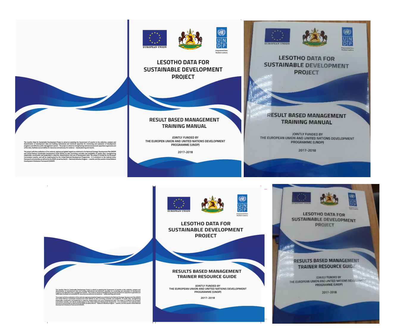
Pic 4. Training Manuals for the Results Based Management Training, and file folders for the training session.